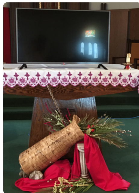
A TV monitor for watching Mass has been placed atop the altar at Monocacy Manor.