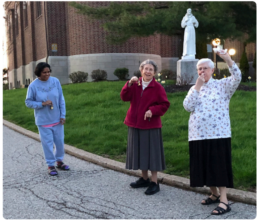
Sisters from San Damiano Convent and Little Flower House took part in Pittsburgh's Illumination Ovation on April 7. Residents stepped outside their buildings and homes at 8 p.m. to applaud frontline workers for their tireless efforts during the COVID-19 pandemic. Our sisters incorporated a bell from South Korea and a whistle from Peru in solidarity with folks around the world.