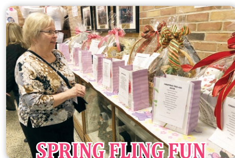
SPRING FLING FUN

welcomed more than 520 cars in a mile-long line during the evening rush hour. The concept was popular with busy members of the workforce and even with elderly and disabled parishioners who were able to receive a blessing and ashes from the comfort of their cars.