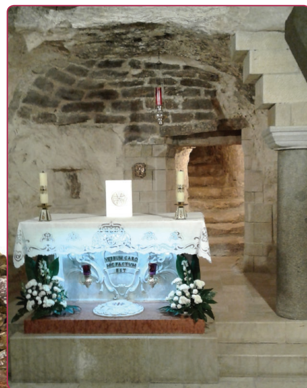
A look inside the ancient church of the Annunciation, erected over a house built into the hillside. According to tradition, this was the home of Miryam in Nazareth. The star in the ground bears the inscription "HERE the Word was made flesh."

On the way to Bethlehem, we stopped in Bethany; and