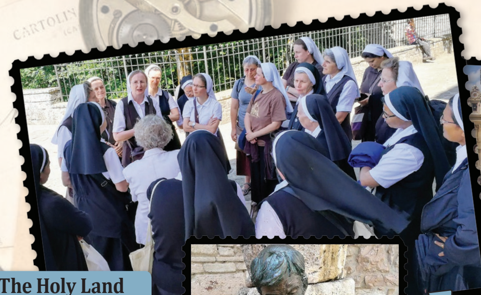
The Holy Land