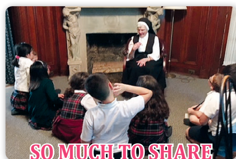
SO MUCH TO SHARE

Our first Spring Fling, a smaller version of our traditional Spring Festival, drew hundreds of patrons to Mount Assisi Convent in April. Our guests enjoyed delicious dinners, baked goods made with love by our sisters, and a stunning basket raffle.