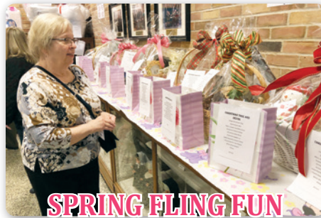
SPRING FLING FUN

welcomed more than 520 cars in a mile-long line during the evening rush hour. The concept was popular with busy members of the workforce and even with elderly and disabled parishioners who were able to receive a blessing and ashes from the comfort of their cars.