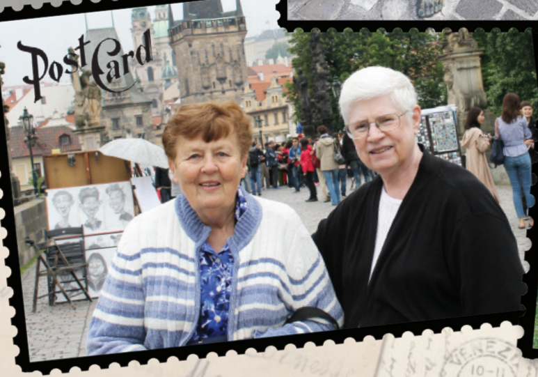
Our Sisters Find Faith Around the World