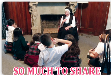
SO MUCH TO SHARE

Our first Spring Fling, a smaller version of our traditional Spring Festival, drew hundreds of patrons to Mount Assisi Convent in April. Our guests enjoyed delicious dinners, baked goods made with love by our sisters, and a stunning basket raffle.