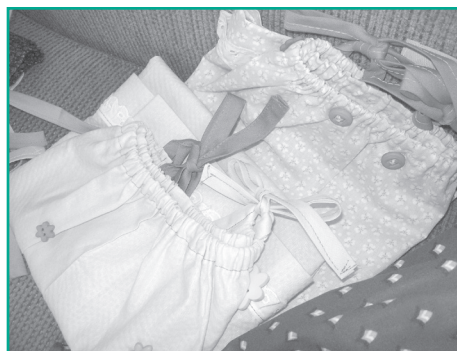
Because most of the recipients live in very warm climates, the dresses are created in lightweight, colorful fabrics and trimmed with elastic and sometimes bows and simple ornamentation.

hours to complete. Sister Mercedes died in 2014, but Sister Elaine and her team are still exhausting her bountiful supply of fabric. They do, however, have to constantly restock their supply of bias tape, lace and trimmings. Over the coming months they will focus on sewing dresses for the smallest children who are in the most need.