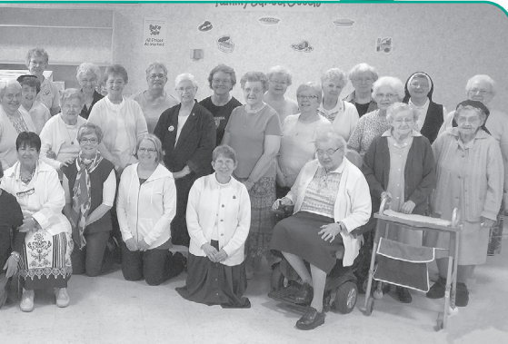
possible by this dedicated team of sisters and volunteers.