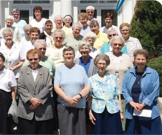
ngs this summer in Bethlehem, Pa. gathered y for this "team photo."