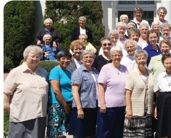
Sisters who attended our annual Provincial meeting outside of Monocacy Manor on a sunny August day