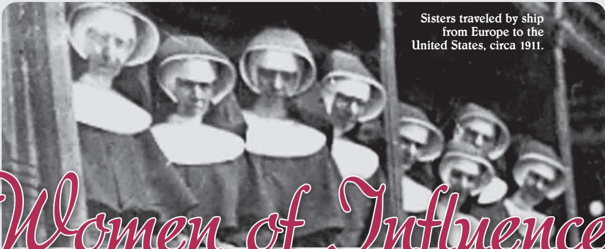
Sisters traveled by ship from Europe to the United States, circa 1911.