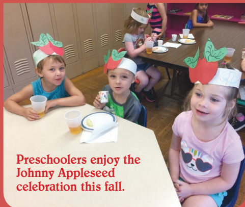
Preschoolers enjoy the Johnny Appleseed celebration this fall.

The parents of a Japanese-American boy will be sharing a list of important Japanese words to ease communication with their son when he becomes stressed. Also a child who bravely battled back from a life-threatening brain tumor last spring rejoined his classmates this year.