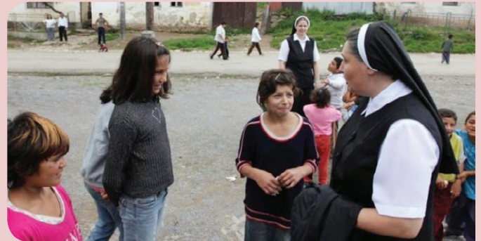
The sisters visited with impoverished Gypsy children in the Slovak village of Lomnička.

We gathered in Bratislava for an opening Mass and then went on to a retreat center in Melčice-Lieskové, Slovakia, for the meeting. Through prayer, discussion and recreation, we deepened our bonds and vision for the future of our congregation. When our work was done, we travelled to many of the convents to visit with the sisters in the Slovak Province and stayed overnight in Trstená and Ružomberok. At each stop, we were greeted with prayers, good wishes and great food.