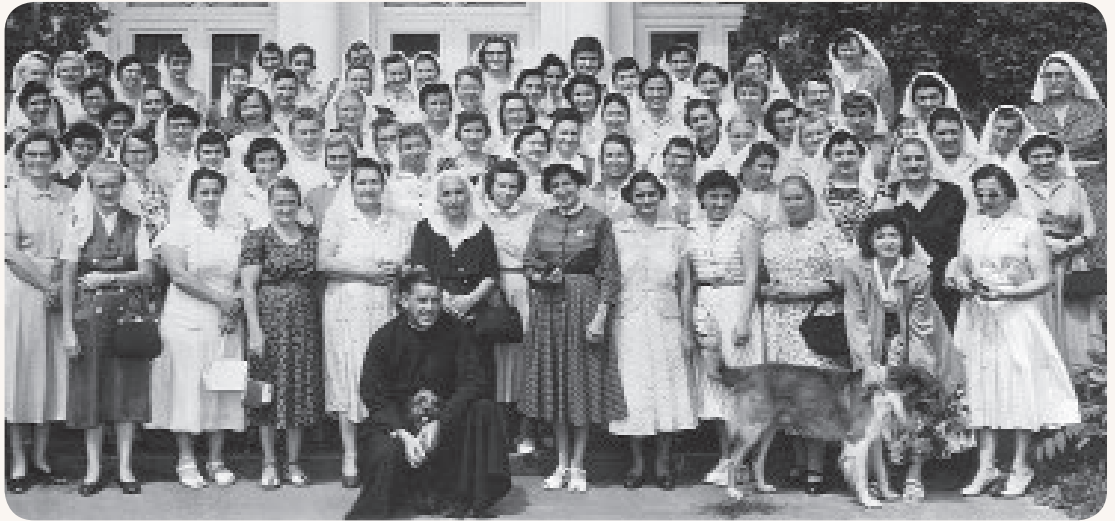
Early retreatants gather for a photo in the summer of 1954.

Visit www.stfrancisctr.org to see all that St. Francis Center for Renewal has to offer these days