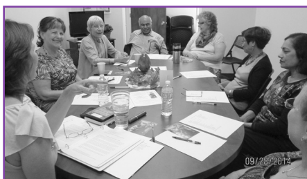
Participants in the Francis and the Sultan program share a round-table discussion.